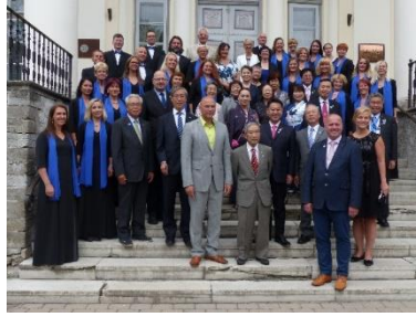
Reception held by Saku Municipality (04.07).