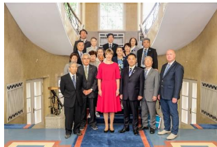
Delegation of Saku City paid a courtesy call on the President of Estonia (03.07).